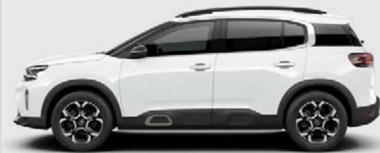
Polar White (F)