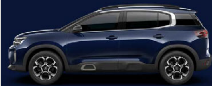
Eclipse Blue (M)