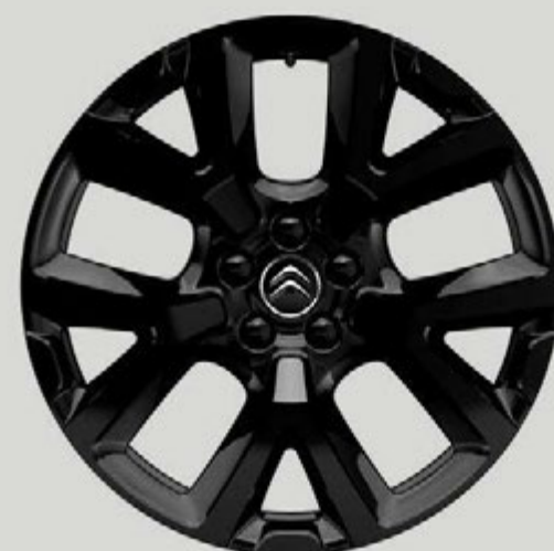
19 inch black 'Art' alloy wheels