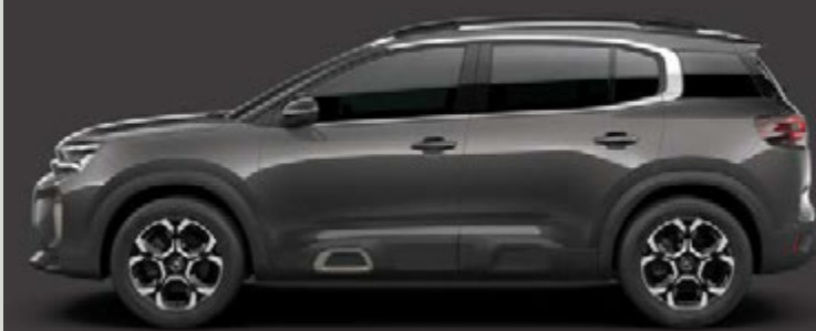
Platinum Grey (M)