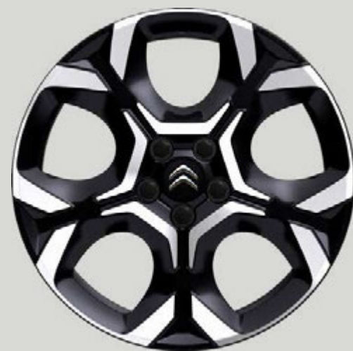
18 inch diamond-cut 'Pulsar' alloy wheels