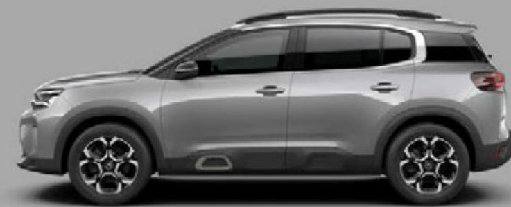
Cumulus Grey (M)