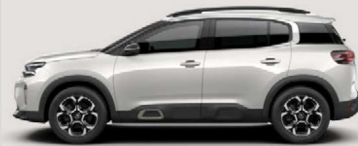
Pearl White (P)